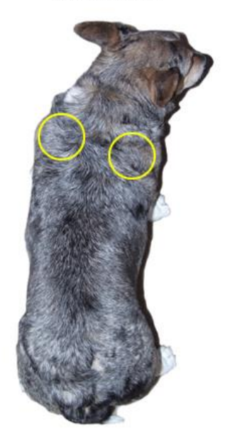
Sites to insert the needle

Remove the protective cap from the lower end of the fluid set, and place the open end of the needle on it. Seat it firmly. Discard the protective cap.