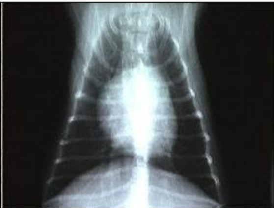
Chest X-Ray – Normal Heart

A leaky heart valve can be replaced surgically in people. However, this is usually not feasible in dogs. There are several drugs that will improve heart function: