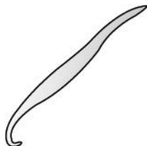
Hookworm (5x actual size)

Since the dog's environment can be infested with hookworm eggs and larvae, it may be necessary to treat with chemicals to remove them from your yard. We can offer recommendations for grass-friendly products.