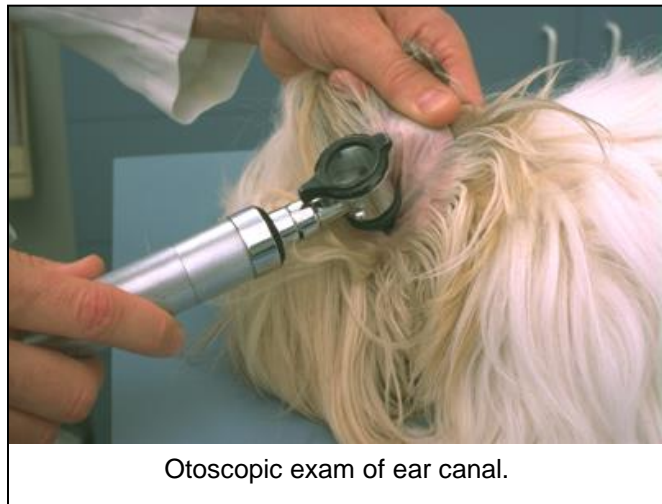
Otoscopic exam of ear canal.

An important part of the evaluation of the patient is the identification of underlying disease. Many dogs with chronic or recurrent ear infections have allergies or low thyroid function (hypothyroidism). If underlying disease is suspected, it must be diagnosed and treated or the pet will continue to experience chronic ear problems.